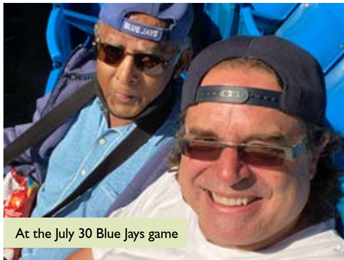
At the July 30 Blue Jays game